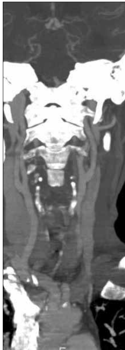
Figure 1: Cerebral tomography angiography of the supraaortic trunks. The internal carotid arteries are permeable, with normal diameters.

Antiplatelet therapy with acetylsalicylic acid 100 mg was started. Cranial MRI did not show any acute ischemic lesions.