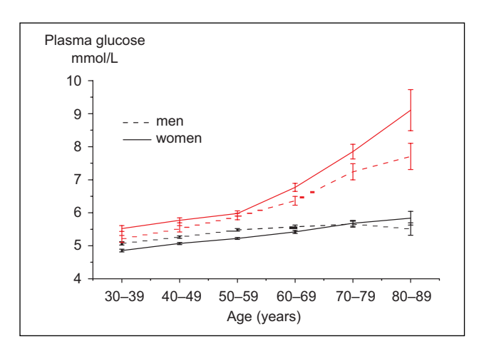
Figure I. Mean FPG fasting (two lower lines) and 2hPG (two upper lines) concentrations (95% confidence intervals shown by vertical bars) in 13 European population-based cohorts included in the DECODE study.<sup>11</sup> Mean 2hPG increases particularly after the age of 50 years. Women have significantly higher mean 2hPG concentrations than men, a difference that becomes more pronounced above the age of 70 years. Mean FPG increases only slightly with age. FPG = fasting plasma glucose; 2hPG = 2-h post-load plasma glucose.

2hPG = 2-hour post-load plasma glucose; ADA = American Diabetes Association; FPG = fasting plasma glucose; IGT = impaired glucose tolerance; IFG = impaired fasting glucose; WHO = World Health Organization.